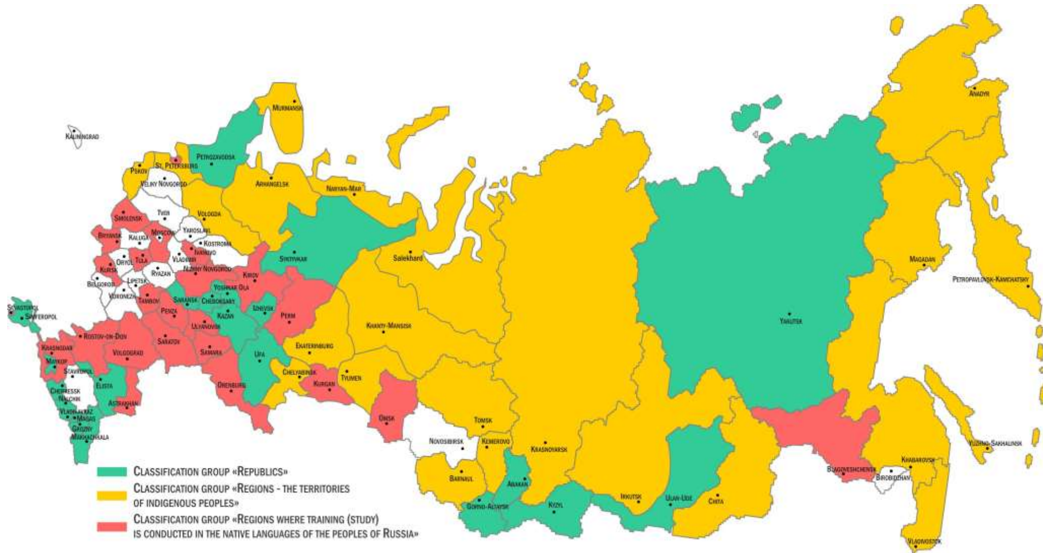
Figure 1. The territorial distribution of regions groups in accordance with the type of language situation.