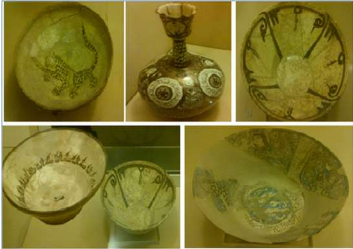
Fig # 1(a) Glazed and Painted vessels with Arabic inscription.