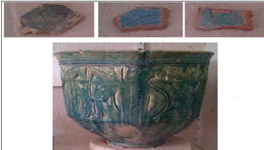
Fig # 1(b) Broken glazed imported vessels (Courtesy National Museum Karachi).