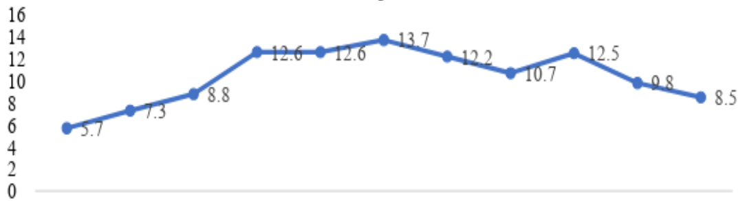
Figure 2. Change in the level of production activities' profitability of agricultural organizations of the Russian Federation using subsidies in comparison with profitability without using subsidies.

According to the agricultural census in 2015, the number of agricultural organizations that received credit funds is 2234 pcs. or 37.4% of the total number of agricultural organizations, small enterprises - 2113 pcs. (32.7%), and micro-enterprises - 1668 pcs. (13.8%) [20, p. 260]. Despite the growth of financial state support, the number of enterprises receiving this support for all categories of enterprises is no more than 30%, the received funds of the organization are spent mainly on replenishment of working capital. The rest of agricultural producers are not able to operate at a cost-effective level due to lack of support from the state and difficult external economic and political conditions of management.